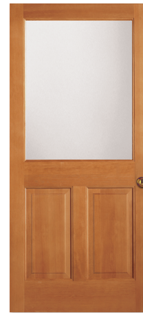
7044 WB INTERIOR

All doors with WaterBarrier come standard with UltraBlock® technology and Weather Seal™ process at stile-and-rail joints.