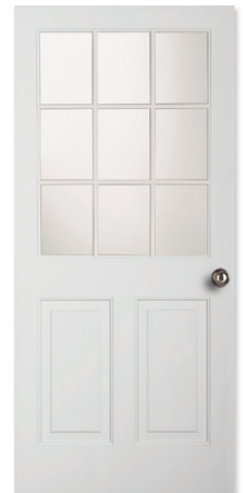
37944 WB EXTERIOR