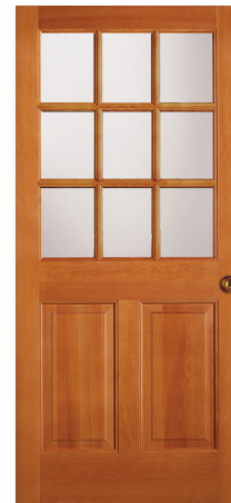
37944 WB INTERIOR