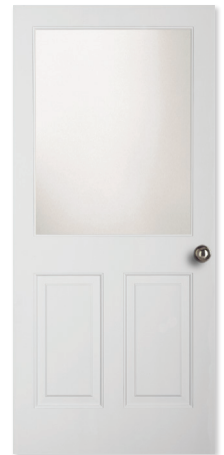
7044 WB EXTERIOR